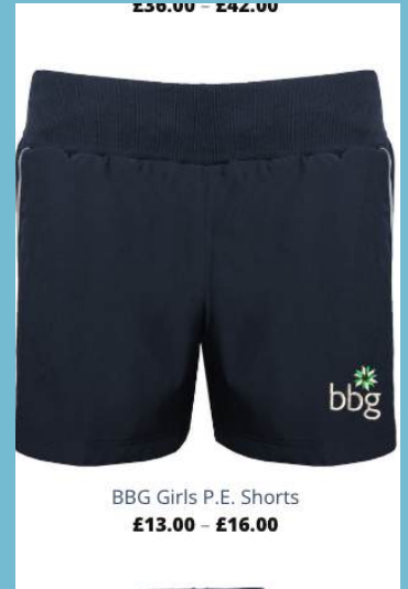
BBG Girls P.E. Shorts £13.00 – £16.00