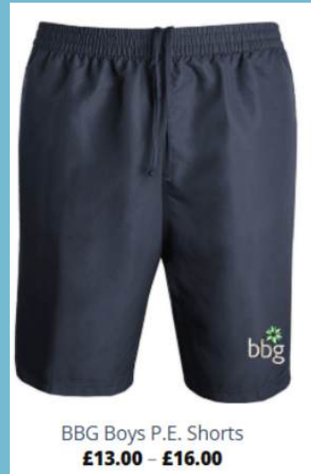
BBG Boys P.E. Shorts £13.00 – £16.00