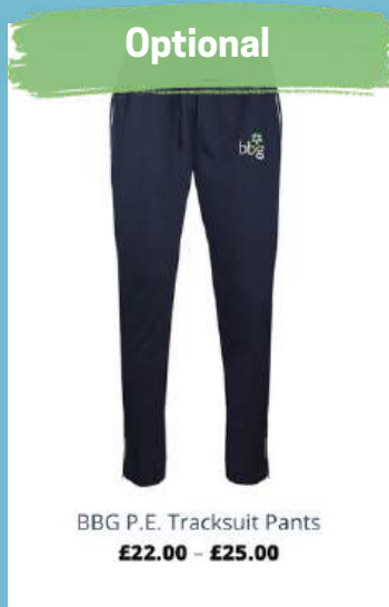
BBG P.E. Tracksuit Pants £22.00 – £25.00