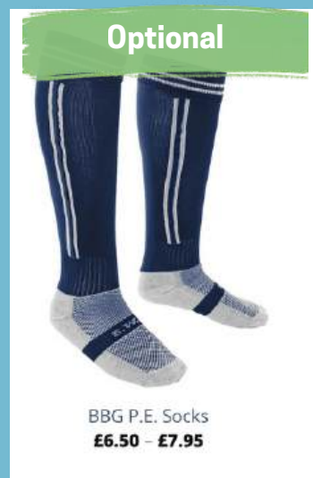
BBG P.E. Socks £6.50 – £7.95