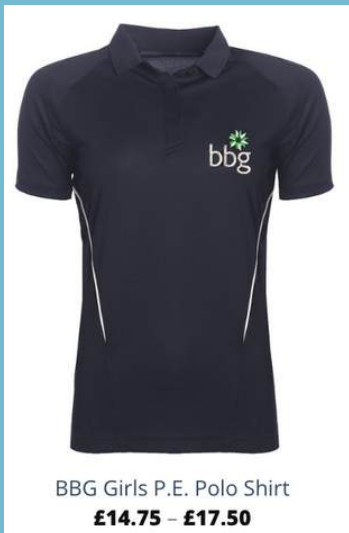
BBG Girls P.E. Polo Shirt £14.75 – £17.50