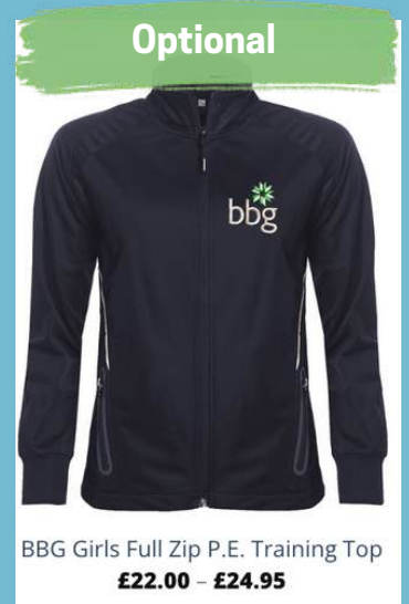
BBG Girls Full Zip P.E. Training Top £22.00 – £24.95