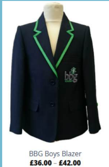
BBG Boys Blazer £36.00 – £42.00