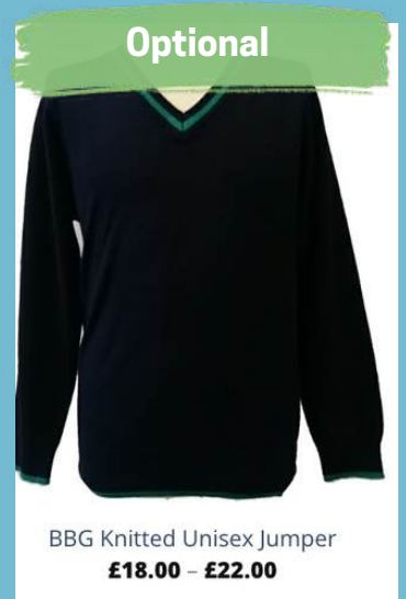
BBG Knitted Unisex Jumper £18.00 – £22.00

There will be an opportunity to purchase and/or order items of school uniform at the Year 6 Information Evening on 25 June. Alternatively, BBG Academy uniform can be purchased from Sports FX, Unit 12B Victoria Spring Business Park, Wormald Street, Liversedge, WF15 6RA. Tel 01924 923254