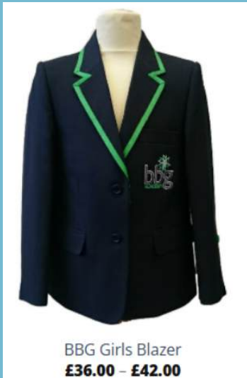
BBG Girls Blazer £36.00 – £42.00