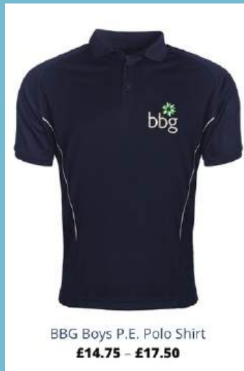
BBG Boys P.E. Polo Shirt £14.75 – £17.50