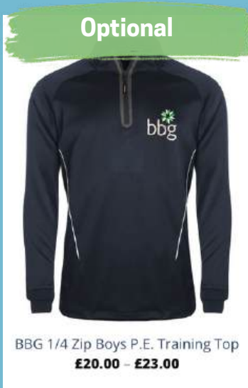
BBG 1/4 Zip Boys P.E. Training Top £20.00 – £23.00