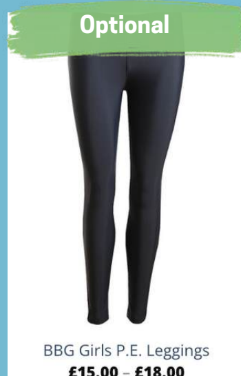
BBG Girls P.E. Leggings £15.00 – £18.00